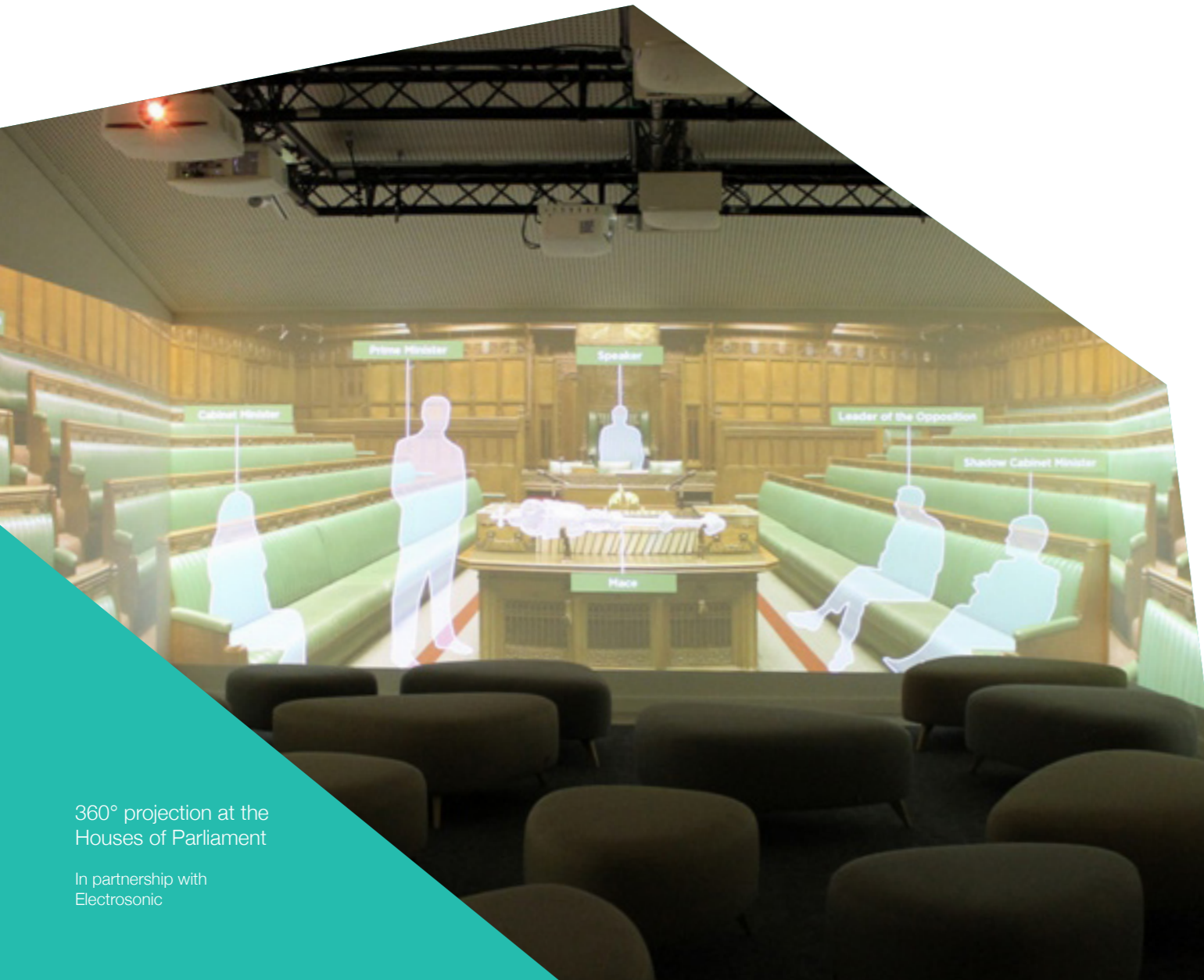
360° projection at the Houses of Parliament

In partnership with Heritage Interactive